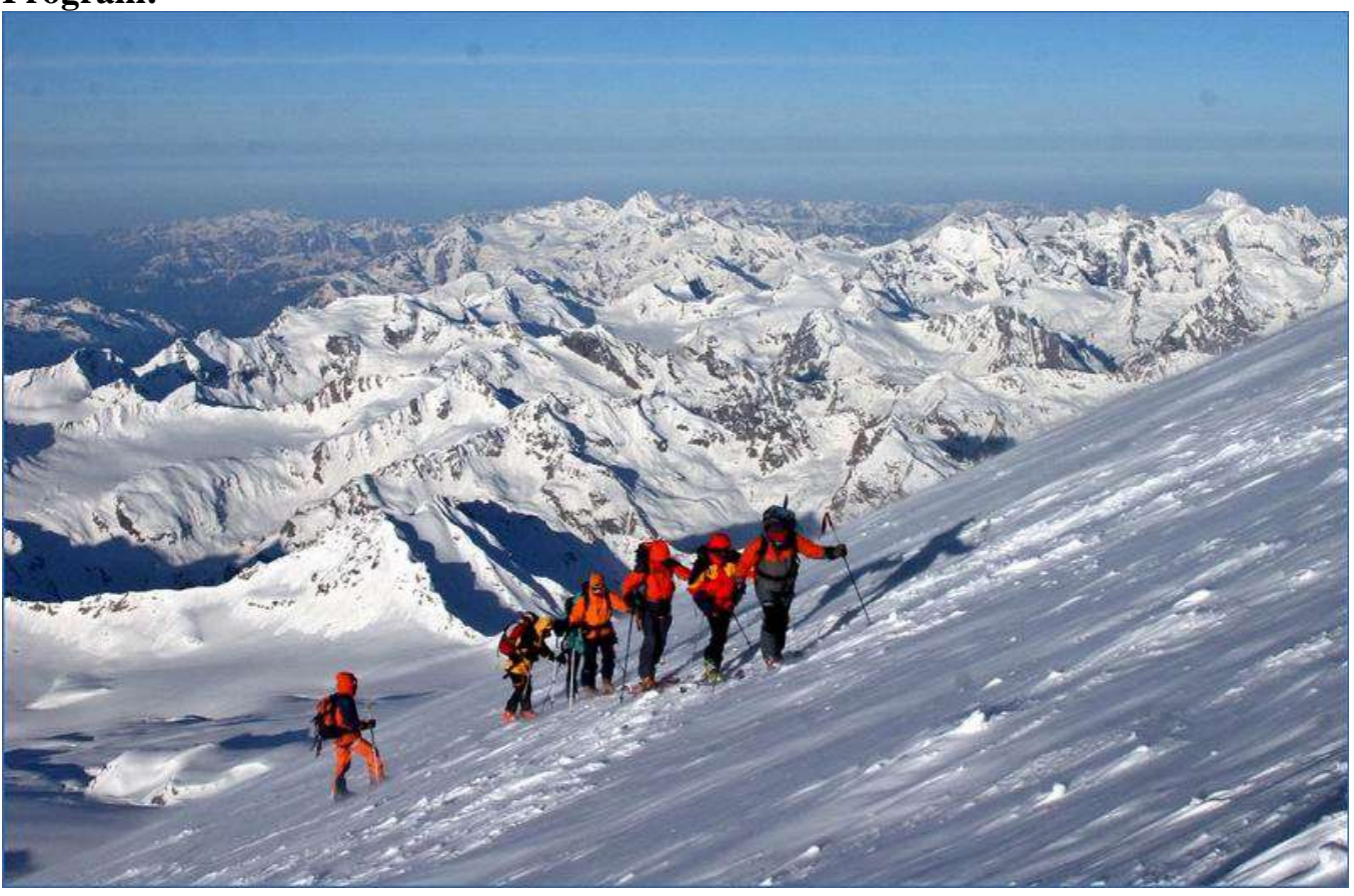
Day 1. Flight to Min Vody, arrival. Transfer to to the hotel (at about 2100m) in Baksan valley near Mt Elbrus.